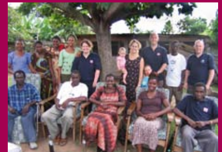
B2A & HDC staff celebrate May day together

Bridge2Aid is making a difference to people's lives, not only through dental and community development opportunities, but also by employing local Tanzanians to 'deliver the goods'. From those who assist in keeping the houses & offices running safely and smoothly to others whose skills ensure that the services of Bridge2Aid and Hope Dental Centre reach those in need, this well oiled machine is gaining momentum! Making ends meet is a challenge when inflation is at 6% and the poor rainy season will only increase food prices even higher. We are proud to be able to provide employment and support to our team of staff. With Community Development pressing forward other posts will soon be filled.