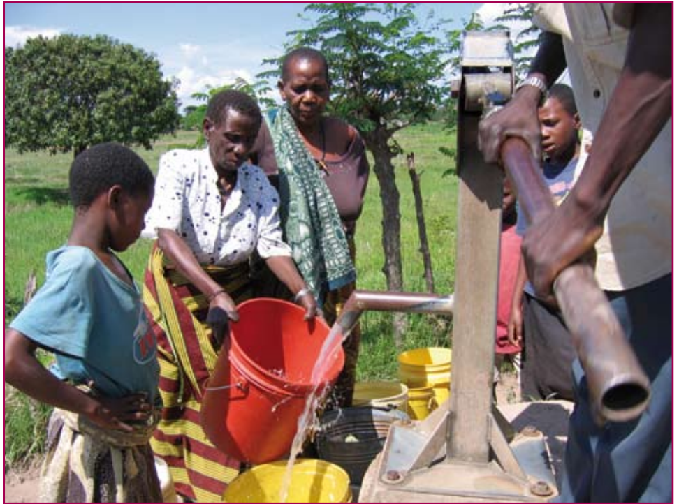
The repaired pump now supplies water to the whole centre