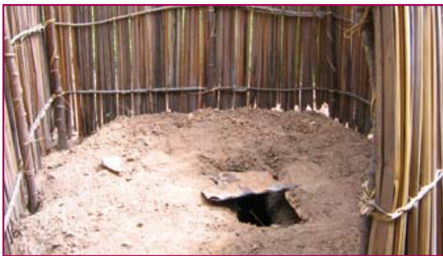
Temporary long drops will be used until the repairs are complete

2. We then discovered that people were using the surrounding 'bush land' to go to the toilet and of course the health risks of this are huge, so the community discussed it together and decided to dig some temporary pit latrines which we assisted them with financially.