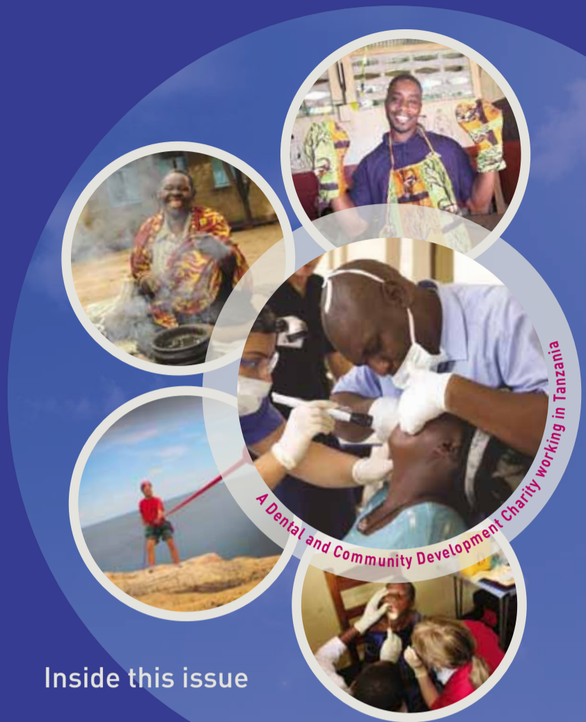
A Dental and Community Development Charity working in Tanzania